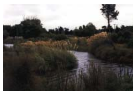
The Styx River from Kainga Road Bridge