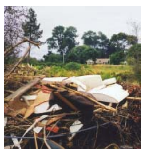
All contributions NOT welcome

My curiosity wanted to discover exactly what was making the awful smell. It was about this time